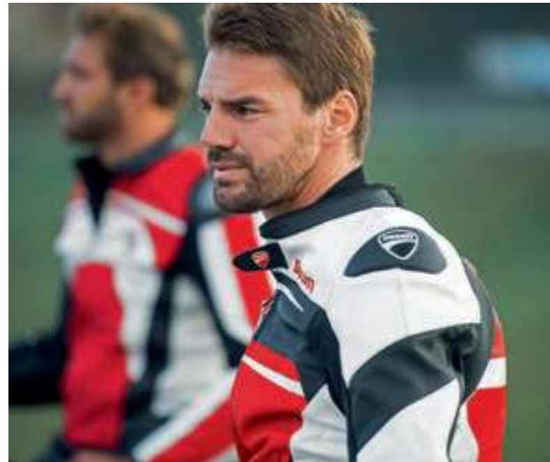
Speed Evo C1 Leather jacket