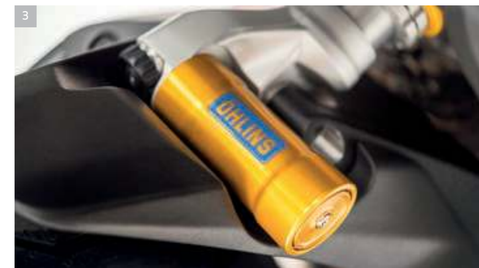
3 Fully adjustable Öhlins shock with tank integrated gas.