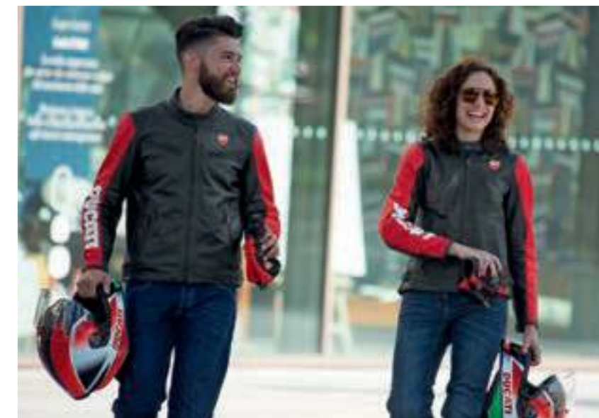
Company C1 Fabric-leather gloves

Ducati Apparel Collection designed by Drudi Performance