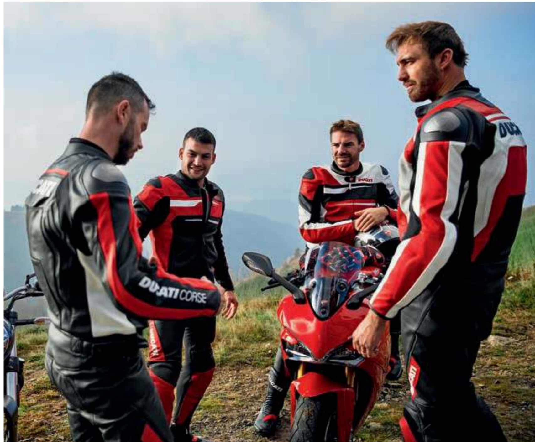
Ducati Corse C4 Leather jacket