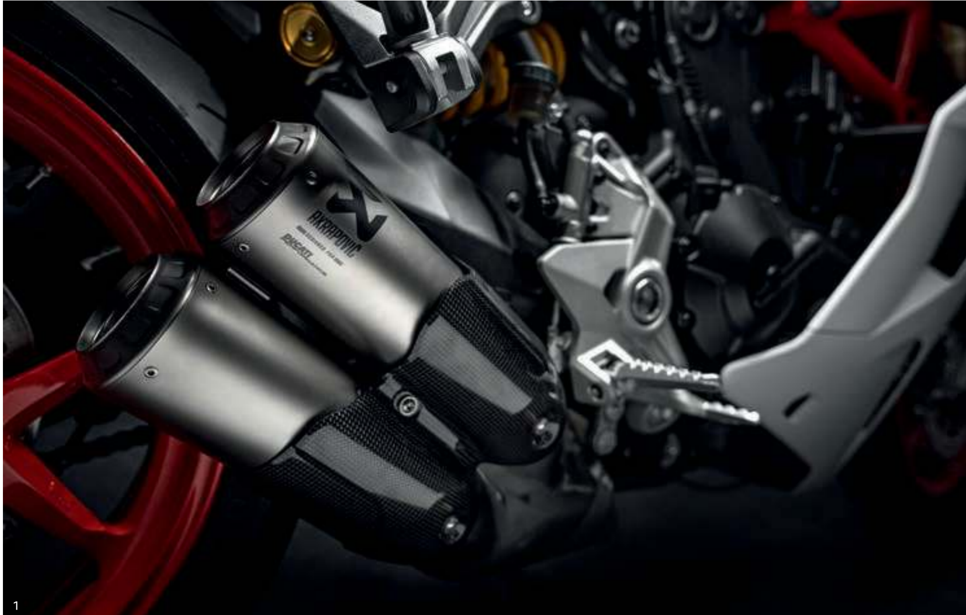
1_ Type-approved silencers.