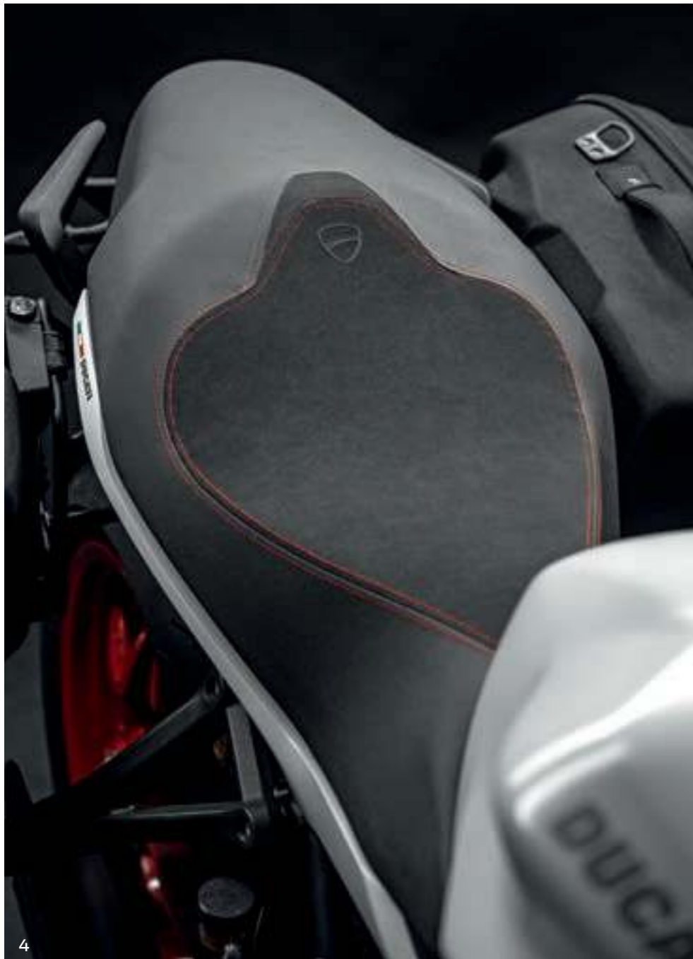
4_ Comfort seat.