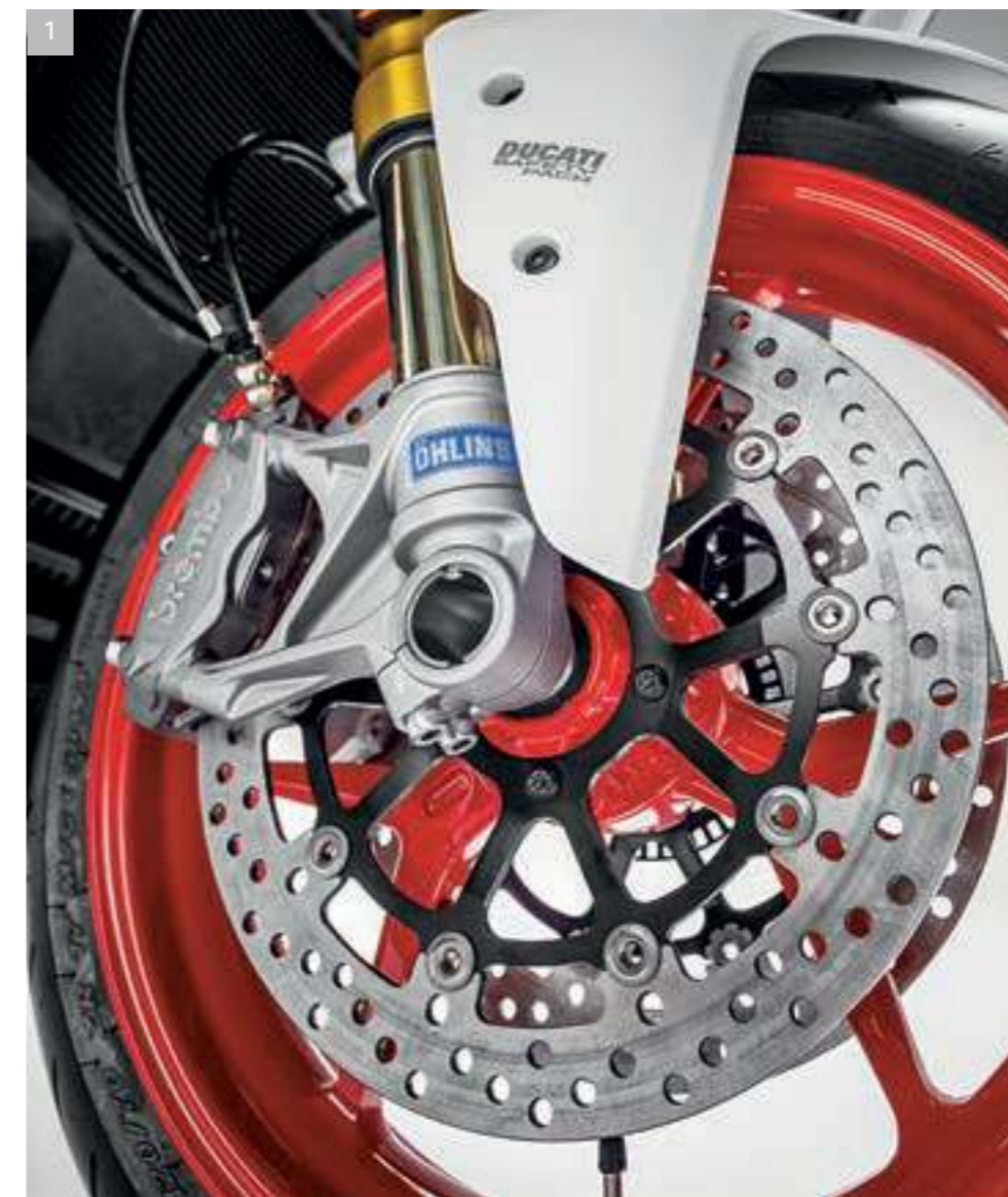
1 Öhlins fully adjustable fork, 320 mm discs and radial caliper Brembo monobloc.