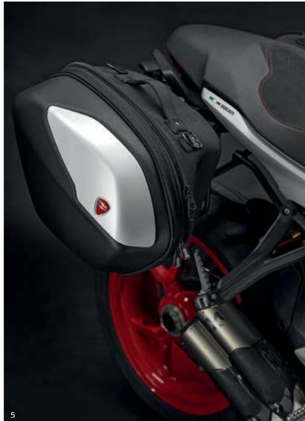
5_ Side panniers.