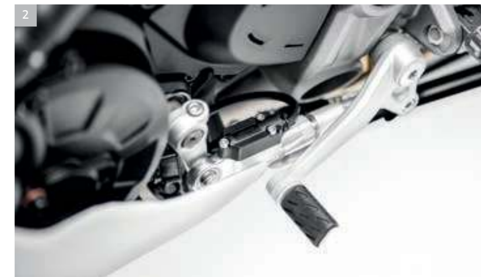
2 Electronic gear sensor Ducati Quick Shift (DQS) up / down.