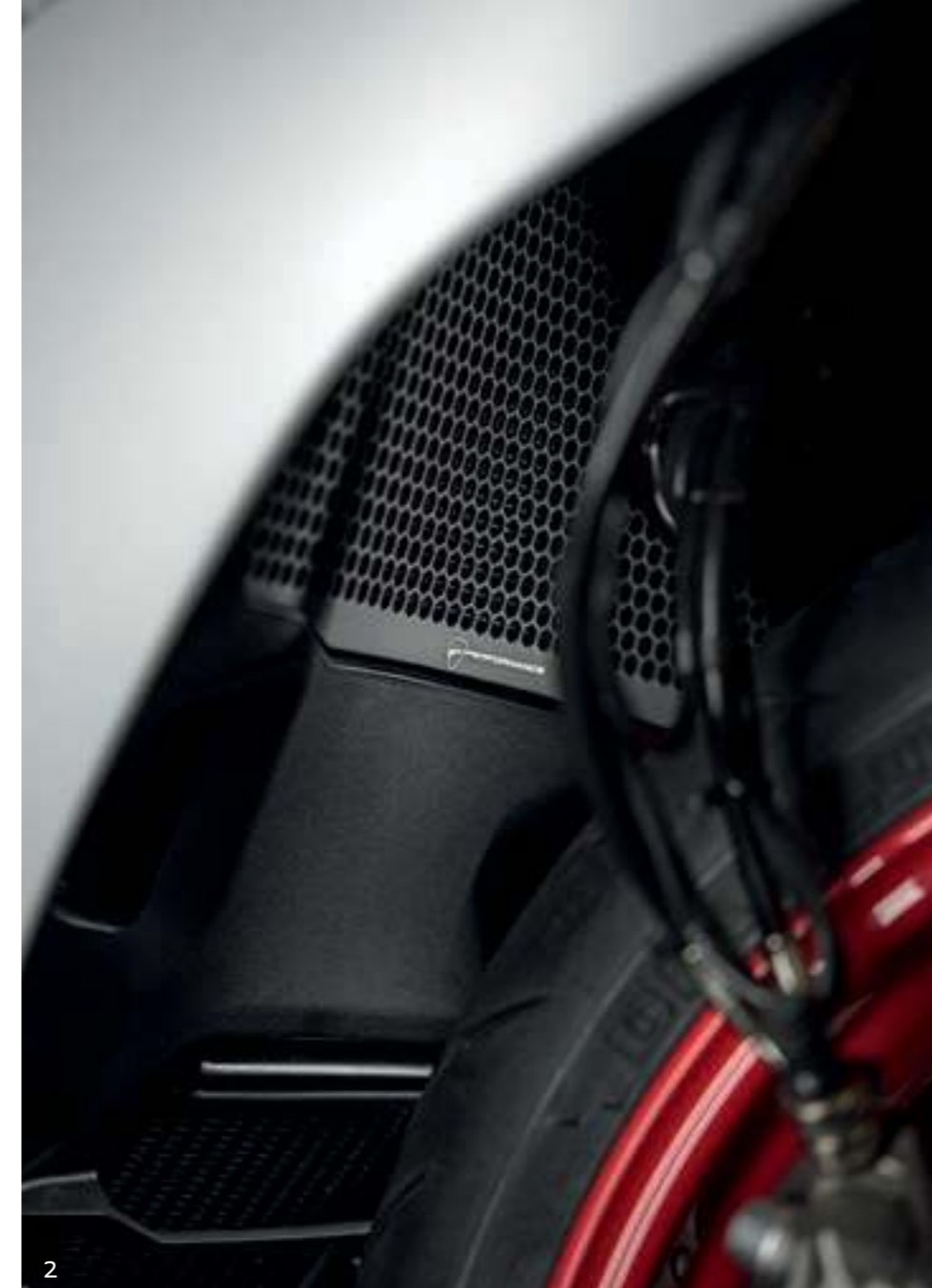
2_ Protective mesh for water radiator. 3_ Aluminium number plate holder.