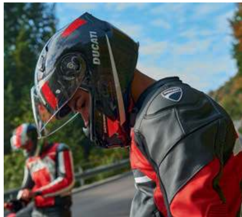
Speed Evo C1 Fabric jacket