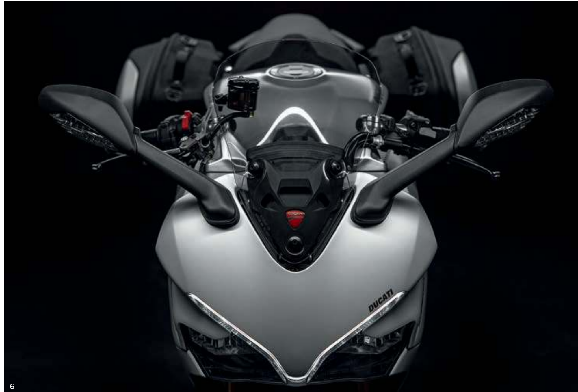
6_ Smoke windscreen.